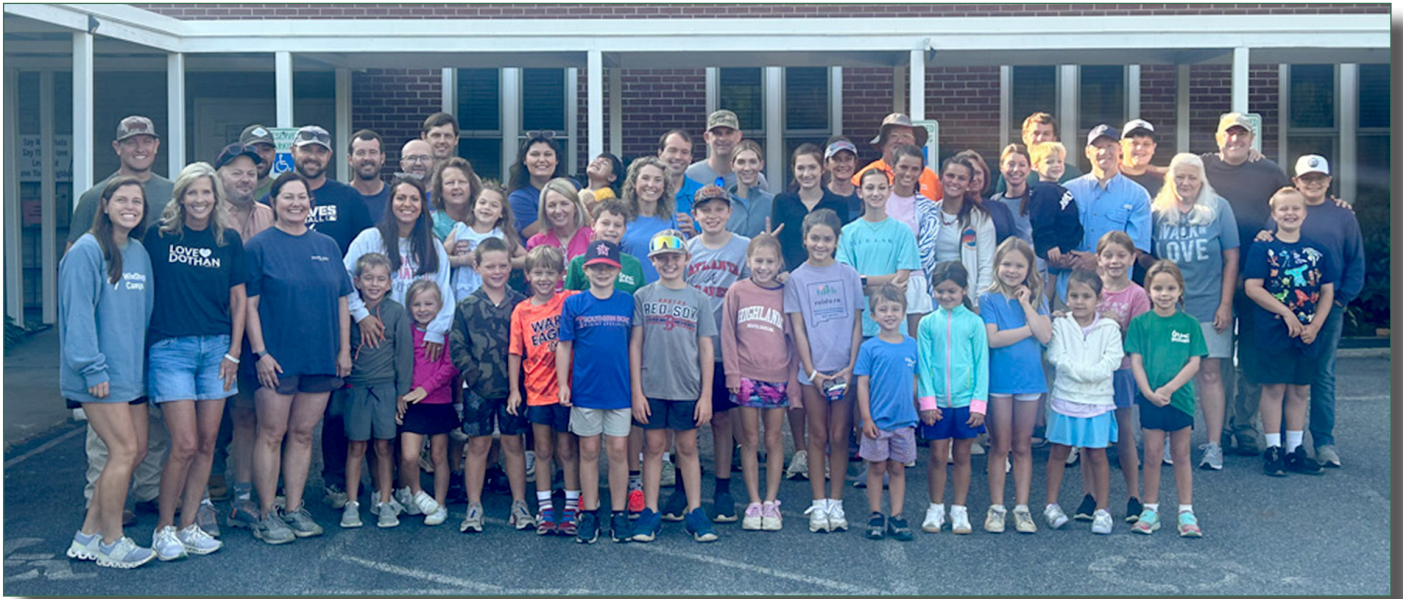
The families that participated in the first Molly White Memorial Family Mission Trip 2025!

Our team hung drywall, installed siding, packed care packages, visited with nursing home residents, cleaned a pet boarding facility, wrote thank-you notes, helped at the humane society and food bank, participated in river cleanup, and much more.